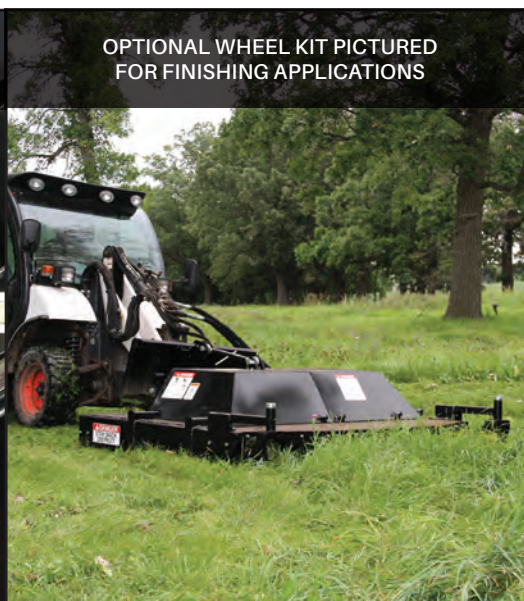
OPTIONAL WHEEL KIT PICTURED FOR FINISHING APPLICATIONS