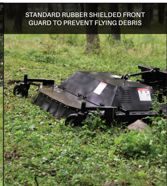
STANDARD RUBBER SHIELDED FRONT GUARD TO PREVENT FLYING DEBRIS